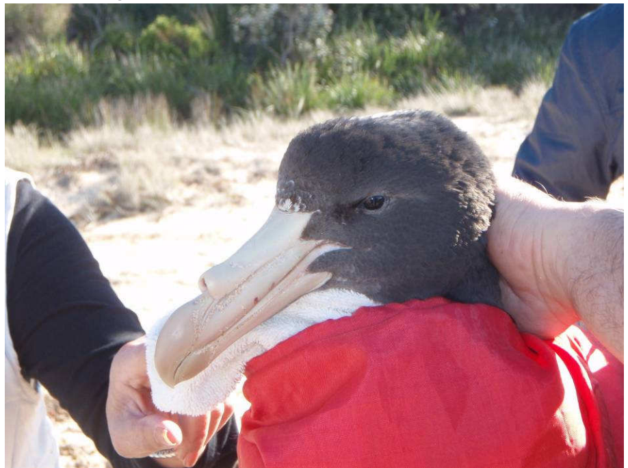
Northern Giant Petrel Macronectes halli .

pulled the side off the cage, tipped it over side-ways, lined it with large sheet cardboard and sat the Petrel in it on about a dozen towels to protect its feet. It was fretting. I felt I had to do something with its left wing, as it stood on it whenever it tried to move. A bit cautiously I opened some swab cloths I had on hand, straddled the bird and tried to cover its wing with the cloth. I taped its beak during this (as I have a sensible attachment to my fingers). The Petrel was not too keen on staying still, so rather awkwardly I taped the wing to its body just enough to stop it